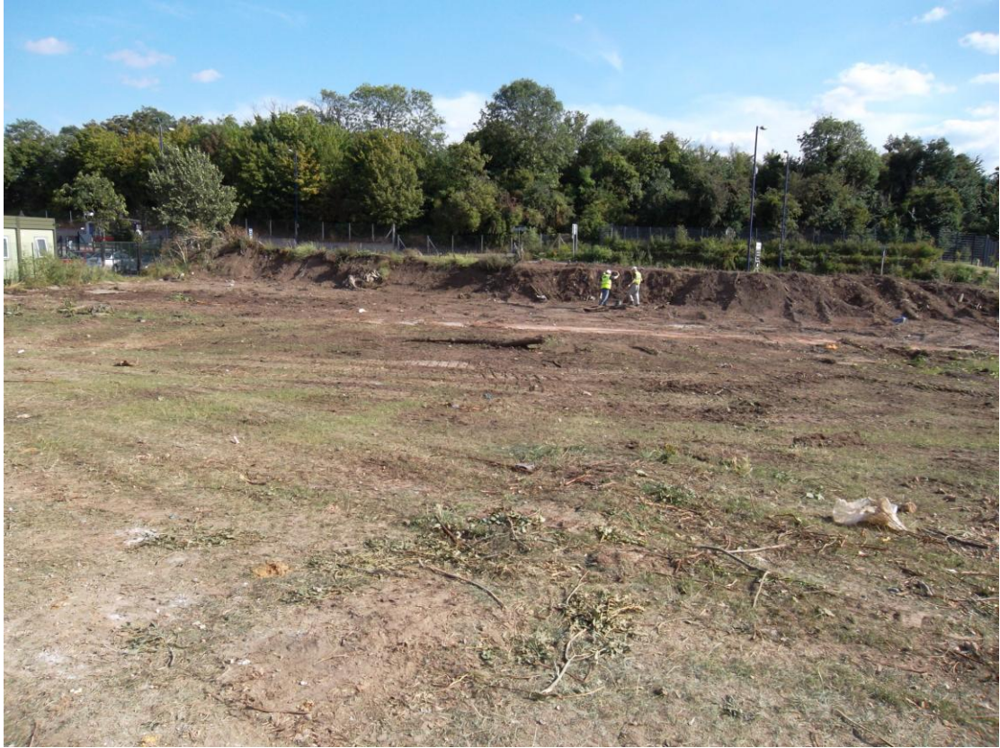
Plate 1. Showing site clearance and looking towards Thames Way (facing south)