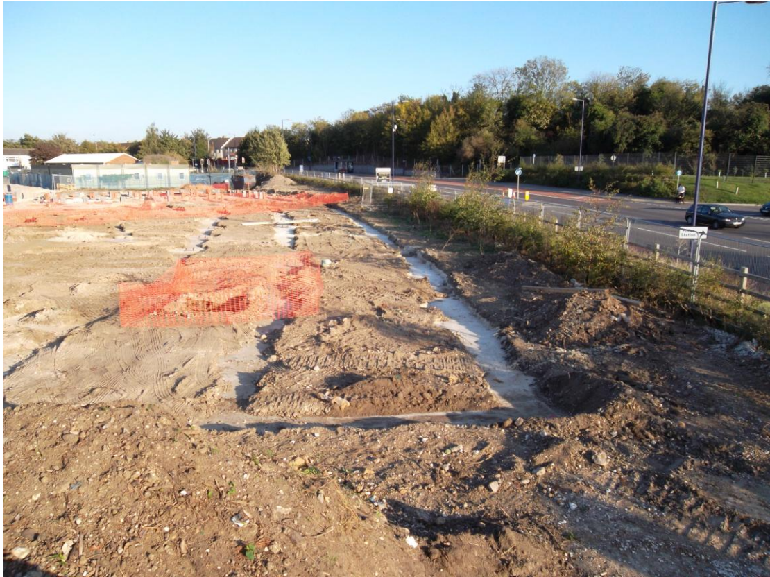
Plate 3. Aspect of the site facing north-east with Thames Way on the right