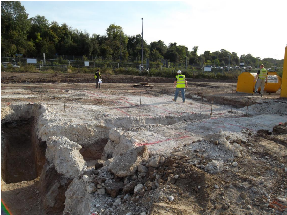
Plate 2. Cutting of foundation trenches through re-deposited chalk. The natural strata of sand and gravel can be seen below the chalk